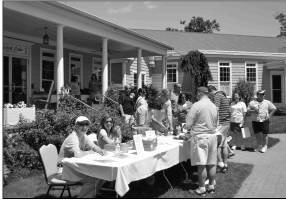
Getting ready for the big day at registration

Enjoy pictures from our 9 th Bailey's Par for Autism