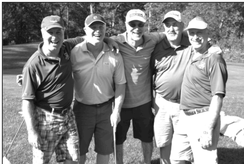
Having a great time at Crystal Lake Golf Club