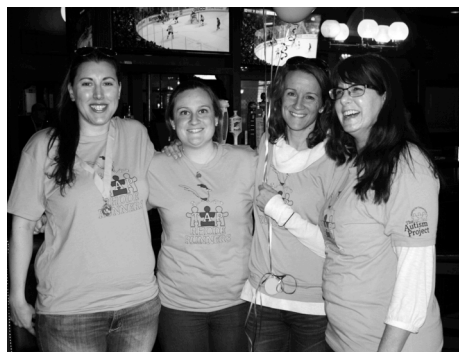
Our friends from the Autism Project "TAP Rhode Runners"