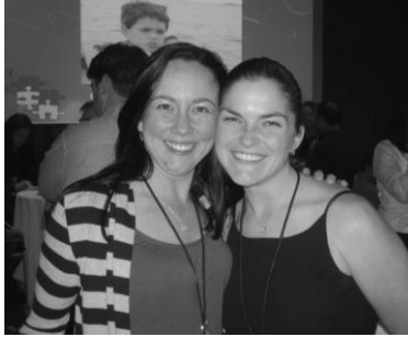
Bailey's Team Wine & Beer Tasting 2010