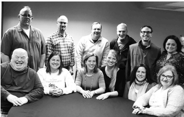
Bailey's Team Board of Directors – January, 2018