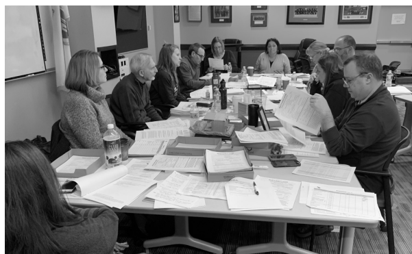
Bailey's Team Board of Directors working hard to determine who to fund!