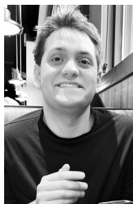
Sweetie snapping a pic of Bailey at lunch