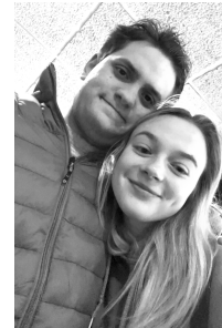
Bailey & Sweetie