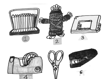
Office Supplies