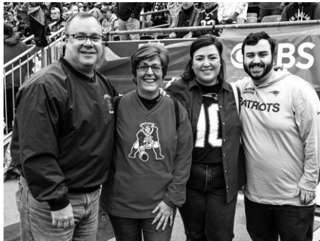
The Buckley Family