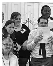
Bailey reading lines from the Martin Luther King speech at a special assembly in Taunton